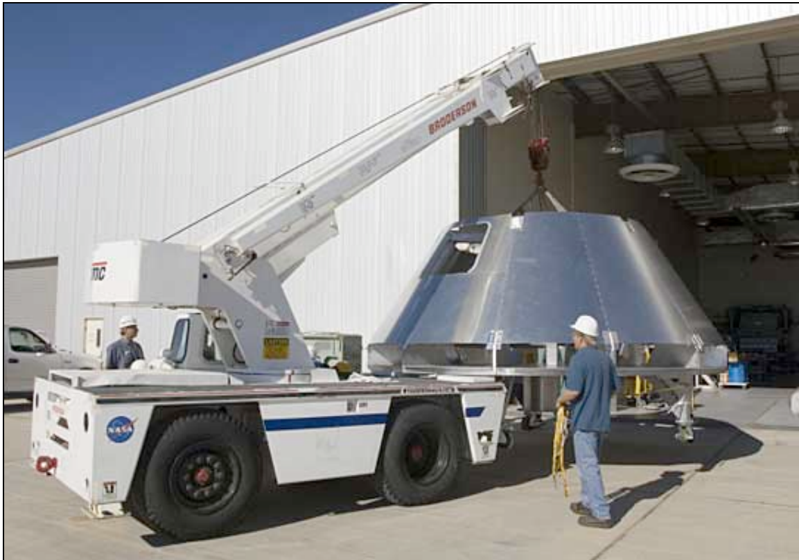
Mock Up of Orion CEV