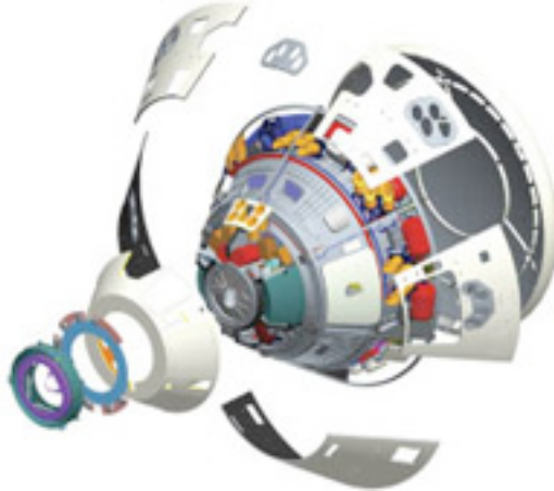
Components of the Orion CEV: Image Credit: Lockheed Martin

http://education.jsc.nasa.gov/explorers/pdf/p5_educator.pdf